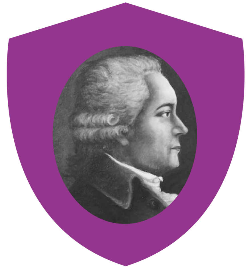
KARL DITTERS VON DITTERSDORF